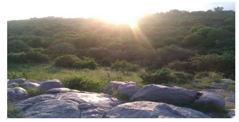
संवाद पत्र अप्रैल 2024 -जून 2024