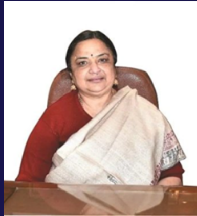
PROF. SANTISHREE DHULIPUDI PANDIT