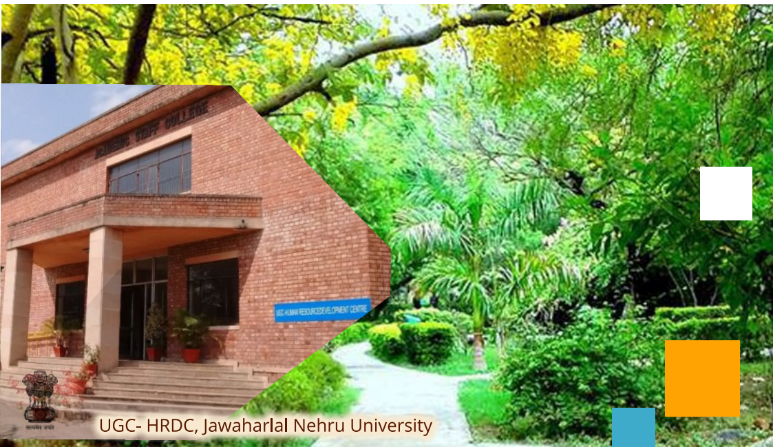
UGC- HRDC, Jawaharlal Nehru University